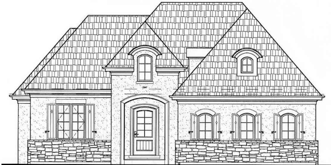
B-1 SIDE LOAD