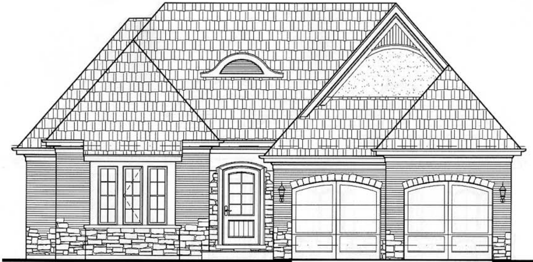
A-2 FRONT LOAD